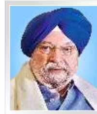
Mr. Hardeep S. Puri Honorable Minister of Civil Aviation