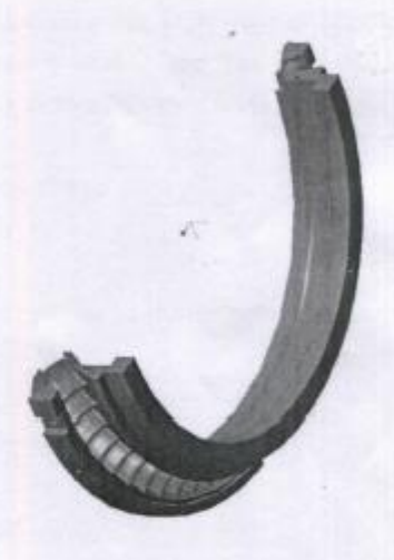
Figure: Stationary Blade Ring Complete and in Half part (Upper Part and Lower Part identical)

Stationary Blade Ring (SBR) is machined from mono block forged rings in two halves. An SBR is used in the First Stage of HP and IP turbine which is a zone of high temperature. This SBR is subjected to extreme creep fatigue stresses and is manufactured under close tolerances and with special machining operations performed on it.