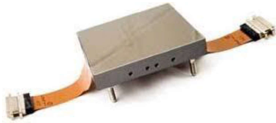
Fig1: 6k x 6k CCD, SiC buttable package with Flexi connector (pictorial representation)

This document outlines the specifications and requirements for the procurement of CCD Detector Controller Electronics. The electronics must be specifically designed to control a 6k x 6k CCD array specifically CCD-231-C6